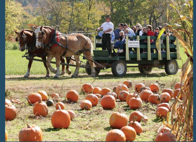
Cedar Circle Farm