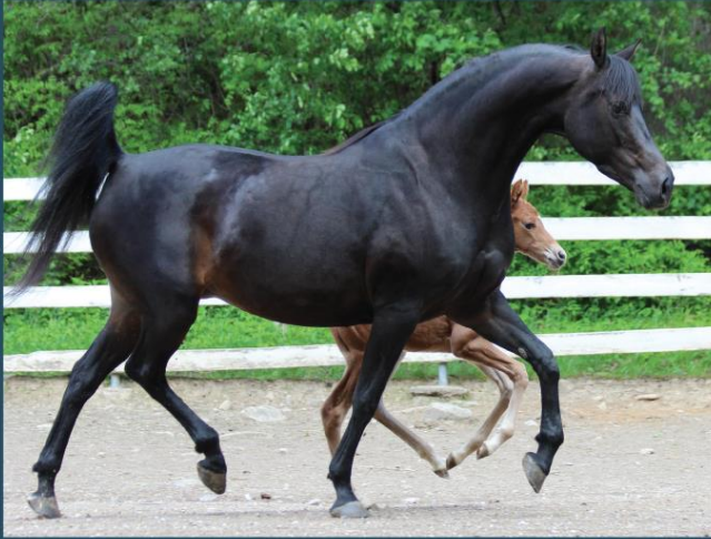
UVM Morgan Horse Farm